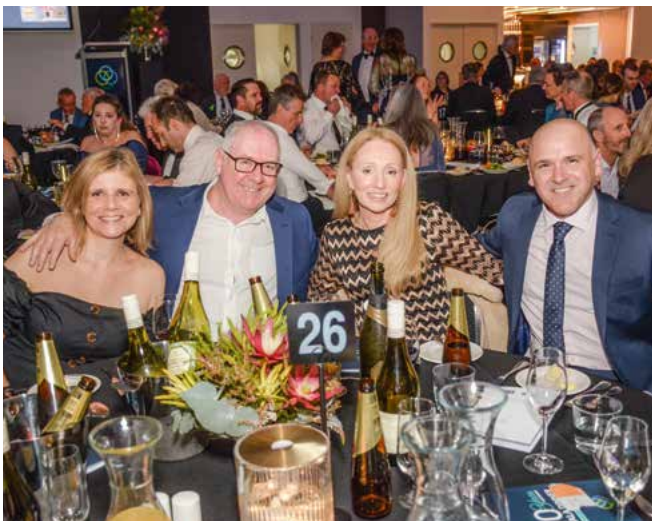
Guests enjoying the dinner