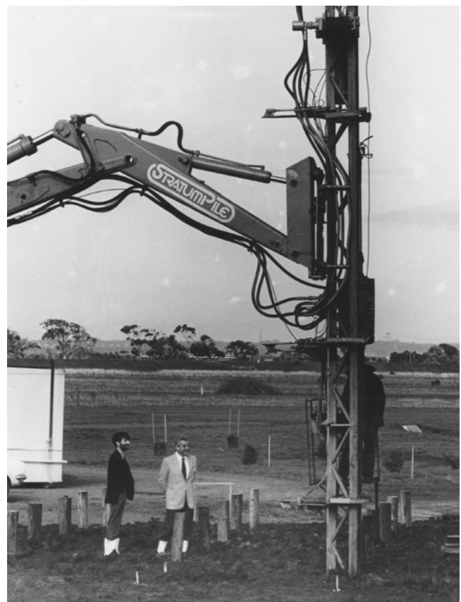
Early drilling works

Regardless of when one attended Cornish, the land upon which we stand is both a unifying thread and bastion of nostalgia, connecting the furthestmost and newest epochs of the College. Indeed, many of our alumni, upon rediscovering the property, remark that its natural beauty and expanse is something featuring prominently in foremost recollections of their time here. Some will, no doubt, harbour memories of environmental classes, cross country days, and community-led markets taking place on the grounds – and now the inauguration of our new faith community, ‘Coracle Collective’, seeks to provide another avenue through which to explore this most cherished outdoor resource. Beyond that, personal anecdotes paint the picture of a truly unique learning environment.