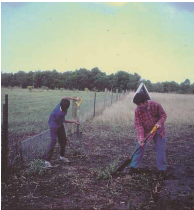
Tending to the farm

Physical items like award certificates, concert flyers, and House banners tell the story of an ‘official’ or ‘objective’ history, whereas samples of student work, candid photographs, and oral histories inch closer to recording a rich tapestry of ‘unofficial’ or ‘subjective’ episodes across space and time. An archive of this sort ought to preserve a sense of the multifaceted community at play, supplying insight to changing styles of student learning, teaching methodologies, and a wider social outreach spanning several eras of the school. Ideally, it is a resource that articulates our continued connection to this spacious property beyond the four walls of the classroom, highlighting the distinctiveness of Cornish’s semi-rural feel, complete with lake and 100 acres of land.